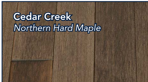
Cedar Creek Northern Hard Maple