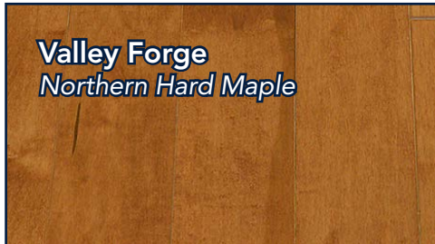
Valley Forge Northern Hard Maple