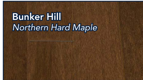
Bunker Hill Northern Hard Maple