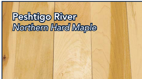
Peshtigo River Northern Hard Maple