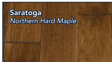
Saratoga Northern Hard Maple