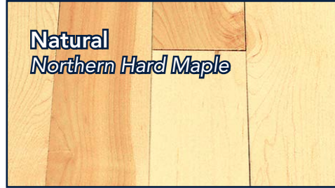
Natural Northern Hard Maple