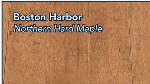
Boston Harbor Northern Hard Maple